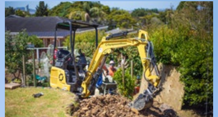
One of EquipmentShare’s new Vio17’s fitted with a Mini-Tilt Coupler.

“Traditionally, if you wanted to change a tilt bucket, you’d have to take the hydraulic hoses off to do so, which can allow dirt to get into the hydraulics. Also, it can be a bit tricky and time consuming for the operator to disconnect and reconnect the hydraulics.”