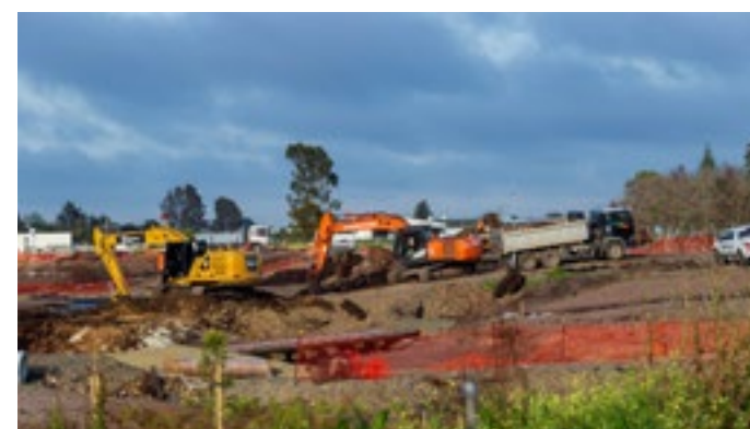
The sticky, peaty material on this site can present a bit of a challenge to moving it. Especially after a little rain.