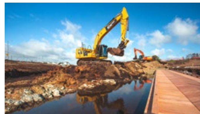
The wooden broad-walks show just how striking the new park will be.