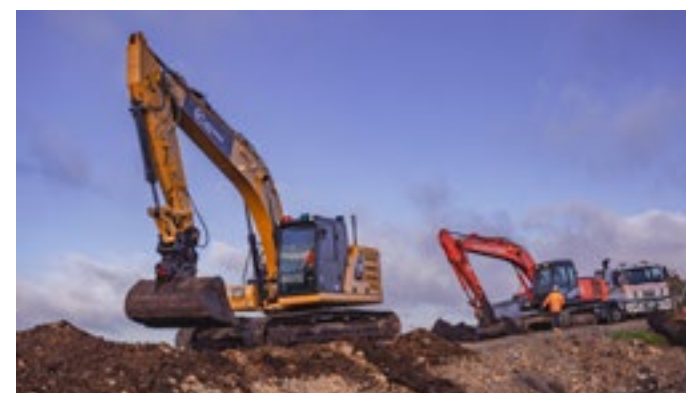
An early start to shift some sticky peat into the waiting trucks. With Auckland traffic like it is a head-start is appreciated.