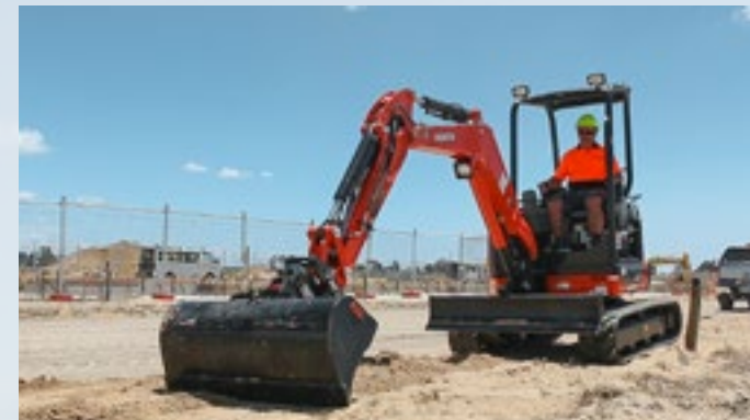
Shaun McKenzie – Operations/Plant Manager.

Now moving the development stage of the retirement villages, the smaller diggers comes into play a key role in their fleet, which ranges from larger 30-tonne machines down to their 1.8-tonne mini diggers. Now equipping their fleet with Attach2 Heli-Tilt Couplers – first sighting them at R&R Tractors, Shaun immediately recognised the benefit of their compact profile, and low weight combined with the ability to tilt 90° each way.